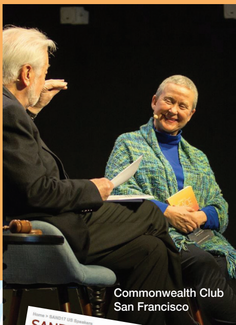
Commonwealth Club San Francisco